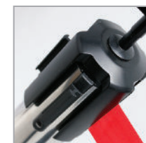
No Tools Required